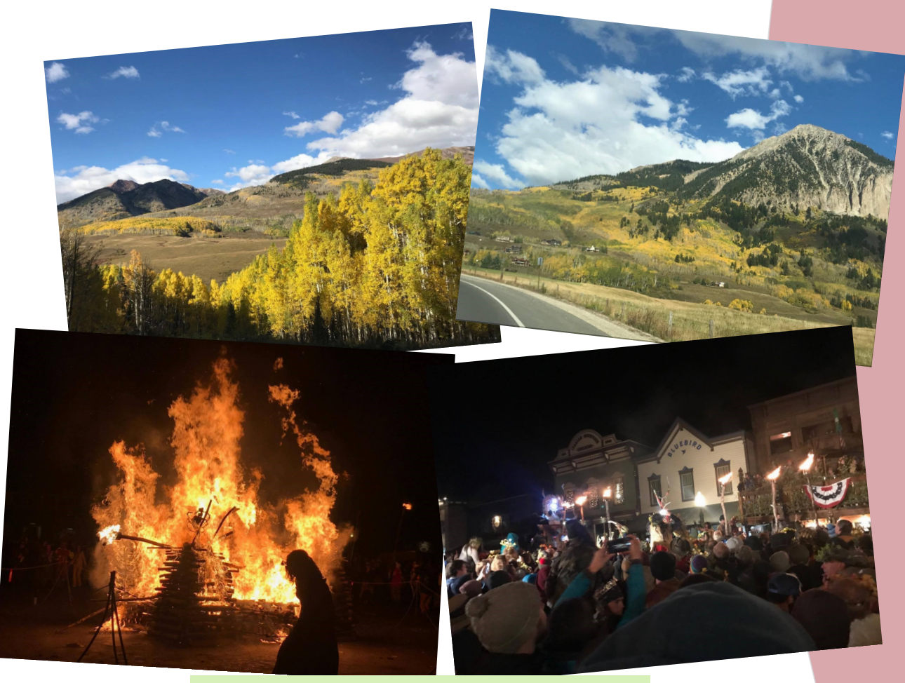
Photos above from last weekend up in CB of yellow foliage and Vinotok

To find more available jobs currently listed, visit the ASU <u>Sustainability Digest</u> web page!