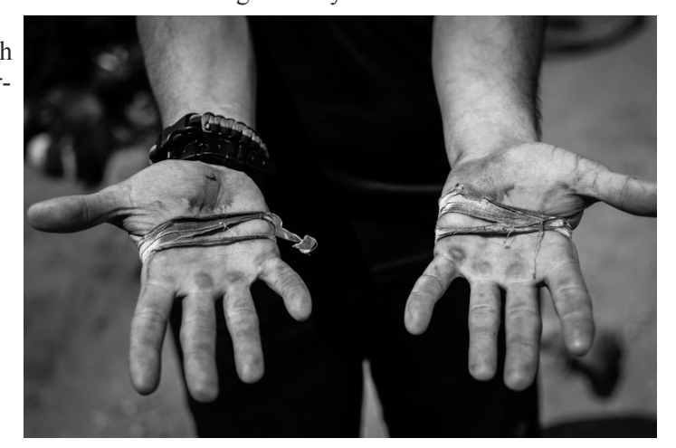
An MEM students hands after a field trip to Moab, UT, biking the White Rim.

entists. Anyone should apply who has already obtained a masters or PhD degree or who is within one year of graduating with a masters or PhD is welcome to apply. Everyone else is encouraged to sign-up for a future session. There will be both an inperson (in NYC, DC, SF) and online section of the fellowship. There is a common application for both the online and inperson sections. Here is the application link:https://www.thedataincubator.com/fellowship.html#apply?ref=wY2tuYXBwQHdlc3Rlcm4uZWR1. You can learn about our fellows at <a href="The New York Times">The New York Times</a> or <a href="Palantir">Palantir</a>. To read about our latest fellow alumni, check out <a href="blog">blog</a>. To learn more about The Data Incubator, check us out on <a href="Venture Beat">Venture Beat</a>, <a href="The Next">The Next</a> Web, or <a href="Harvard Business Review">Harvard Business Review</a>.