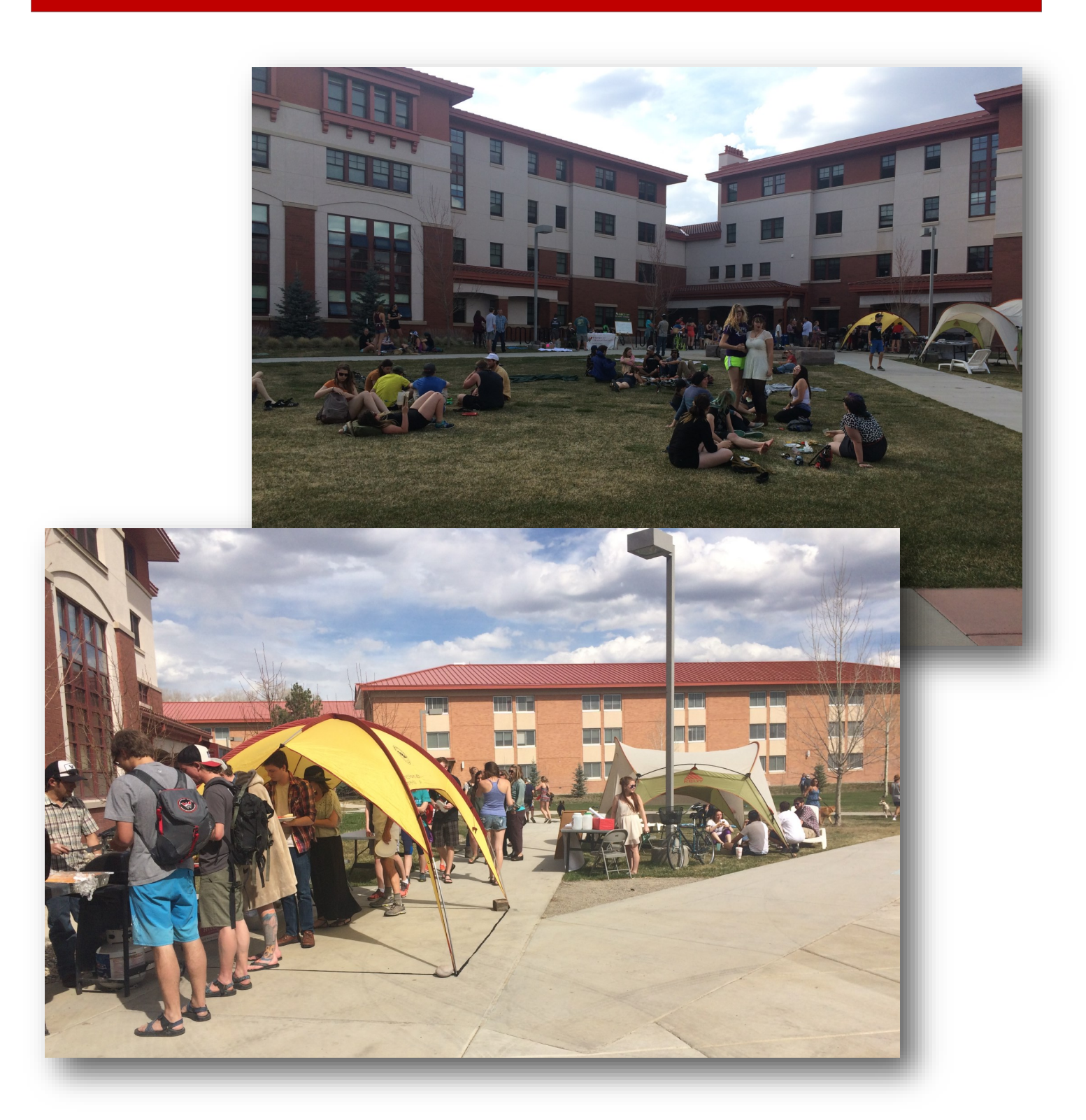
Last Friday at the Earth Day BBQ with great food, music, and people!